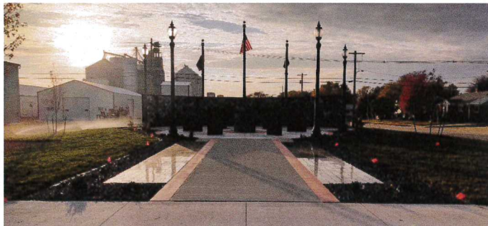
Shickley Sons of American Legion for the 50 Flags Veterans Memorial