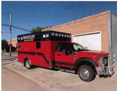
Shickley Fire District