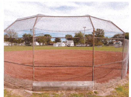
Shickley Ball Field